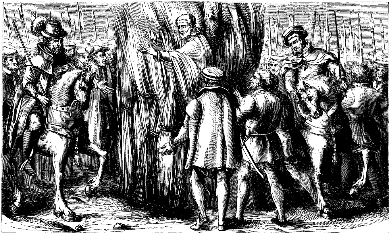
THE MARTYRDOM OF DR. ROWLAND TAYLOR, AT HADLEY.