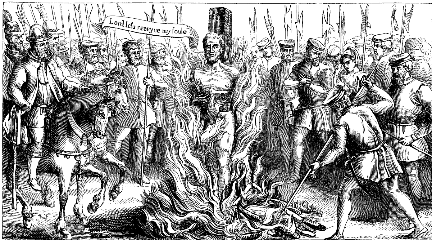
THE BURNING OF MASTER HOOPER, BISHOP OF GLOUCESTER.