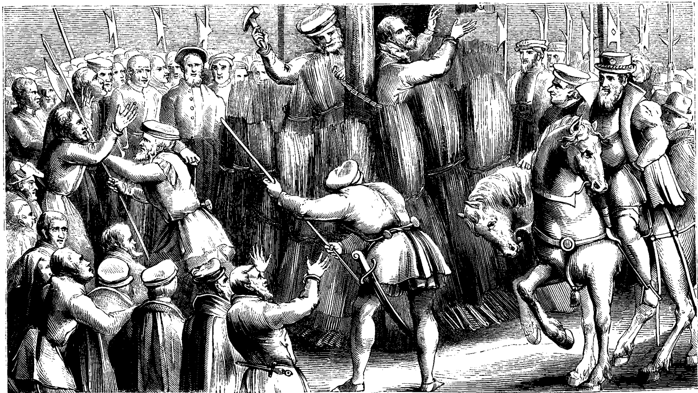
THE BURNING OF MASTER LAURENCE SAUNDERS. AT COVENTRY.