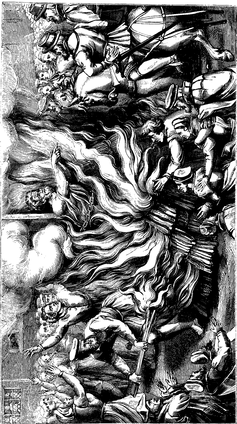
THE BURNING OF MASTER JOHN ROGERS, VICAR OF ST. SEPULCHRE'S.